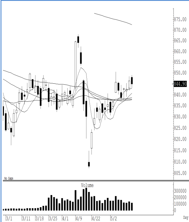
S50M24 (Close 844.90 Chg -1.40)

สัญญาณดูดีต่อเนื่อง รอสัญญาณเปิดเหนือ 850 จุด เพื่อลุ้นใต้ขึ้นไปแถว ๆ 860-865 จุด สั้น ๆ ถ้าไม่ต่ำกว่าแนวรับแถว ๆ 840 จุด แนะนำให้ trading ในกรอบ 840-855 จุด รับรู้กำไร